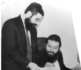
Diskuse o jednom z čísel novin Šornij Sabos. Odkas, synagoga „Chabas“, 2002.